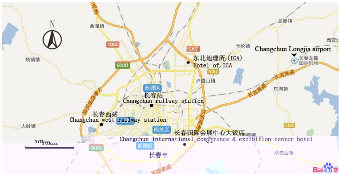
Fig.1 Locations of the airport, railway stations and the hotels

The transportation during the conference between the hotel and the conference (if applicable) will be arranged by the organizing committee.