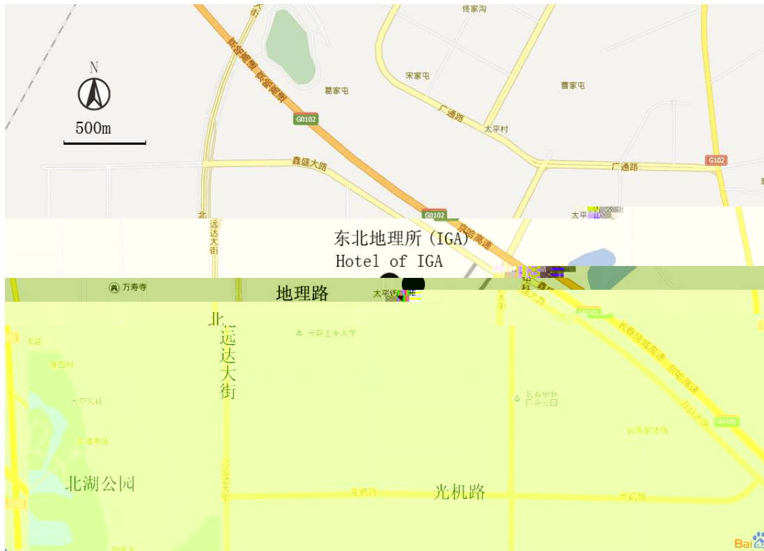
Fig.2 Location of the hotel of IGA